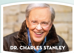
DR. CHARLES STANLEY

Dr. Charles Stanley, pastor of First Baptist Church in Atlanta, Georgia, will speak on a variety of subjects throughout the cruise. Dr. Stanley is heard around the world each week on the television and radio broadcast of In Touch Ministries . Dr. Stanley will be your host for the cruise.