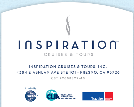
IMAGE AND SOUND RELEASE By booking this travel event you are granting permission for all persons on your reservation to be professionally photographed, audio and/or video recorded and releasing Inspiration Cruises & Tours, Inc. from liability, restrictions, conditions or any compensation for obtaining and using these images and sounds in future promotional materials.

PHYSICAL REQUIREMENTS There may be limitations and restrictions imposed by the travel suppliers (cruise line, air carrier, shore excursion agents, etc.). If you have a medical condition (mobility limitations, pregnancy, etc.), or use medical equipment which could affect your travel, please consult your physician and notify Inspiration so we can inform you of such limitations.