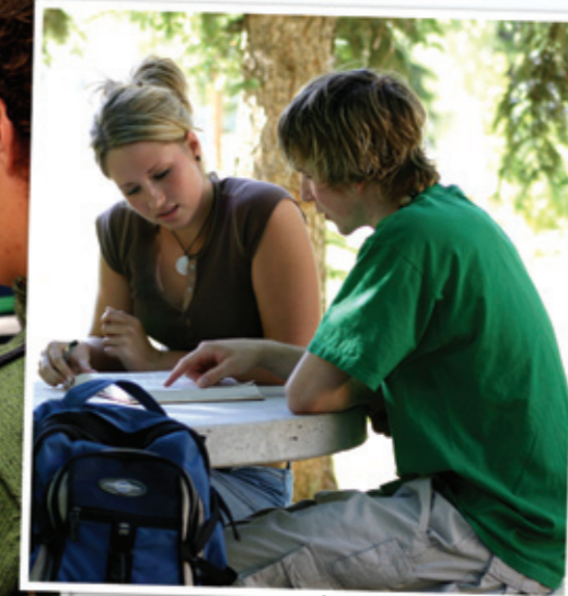
study God's word